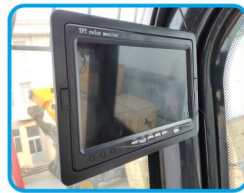
Rear View Camera