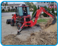
Diagonal Leg in Work