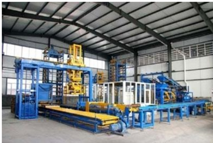
Pictured –Fully Automatic Block Production Line

In 2019, we produced manufacturing equipment used to create eco-friendly construction materials. We have sold equipment to customers in China, South Asia, North America, the Middle East, North Africa and Southeast Asia. The equipment consists of large-scale fully automated production equipment with hydraulic integration. The equipment can be used to produce various types of eco-friendly construction materials that can be used for a variety of projects such as ground works, hydraulic engineering, landscape retention and wall projects.