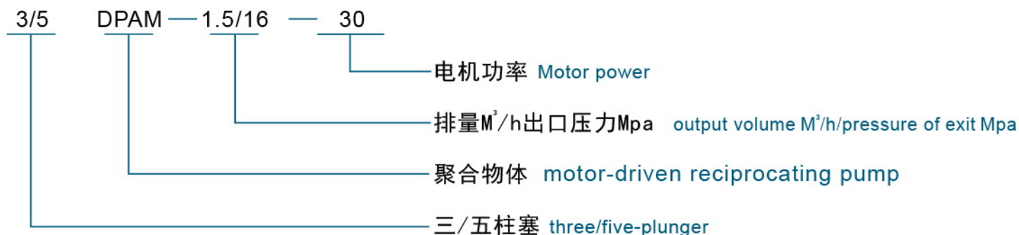
Illustration for compiling Polymer Injection 3DPAM/5DPAM