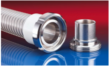
CONNECT MOULD ASSEMBLY 233