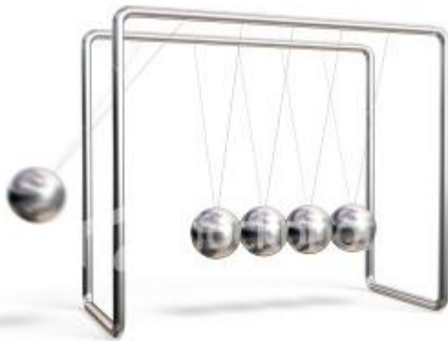
Figure 1 – Newton's Cradle

Jabiru Service Bulletin JSB 014 was also raised to coincide with the original issue of this bulletin. Its purpose is to increase owner awareness of the design and maintenance requirements of propellers. A loose or rough-running propeller will cause engine damage no matter how robust the engine design. Because of this, the following bulletin acts in concert with JSB 014 – failure to follow the recommendations of either bulletin will result in an incomplete approach which does not deliver the improvements to operating safety intended.