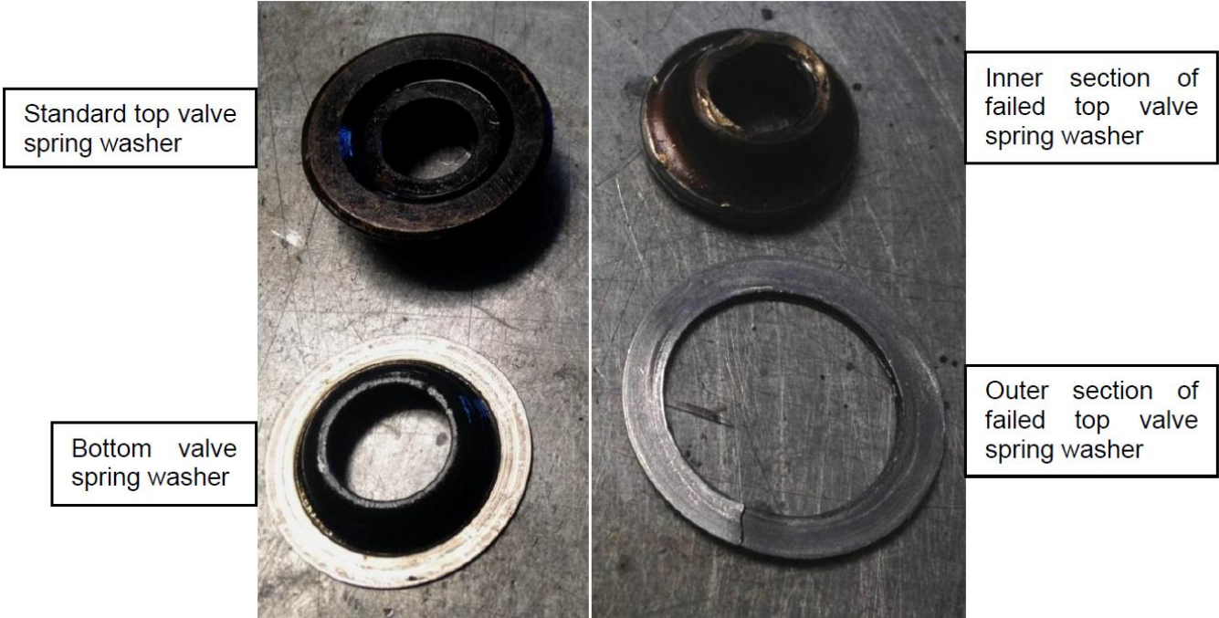
Figure 2: Valve Spring Washers