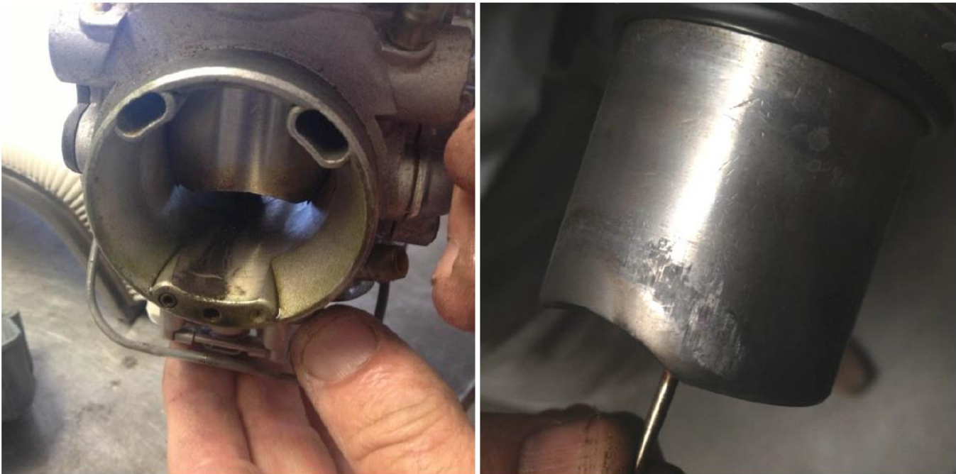
Figure 3: Carburettor Contamination & Slide Wear